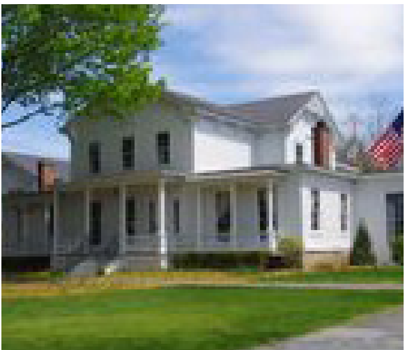
Old Lyme Inn