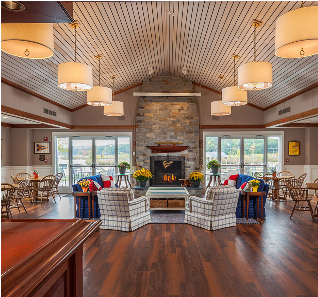
Essex Yacht Club

“Design has the power to create change, optimizing how you live, work, and play. Our user-centric approach uncovers latent needs and opportunities to create solutions that deliver the results you imagine.”