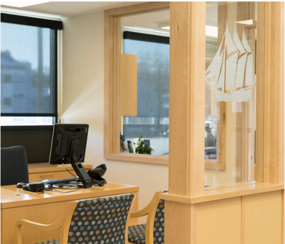
Essex Savings Bank