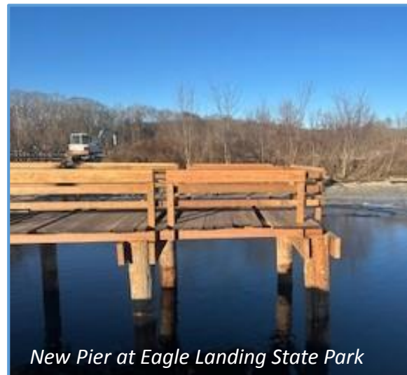
New Pier at Eagle Landing State Park

Eagle Landing State Park is located at 14 Little Meadow Rd, Haddam, CT. For a full list of alternative fishing sites during the closure and more information, visit the CTDEEP website .