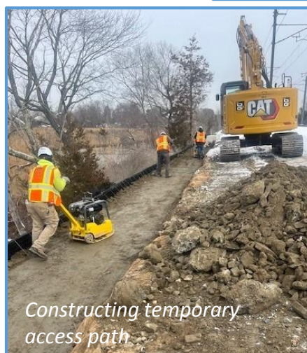
Constructing temporary access path