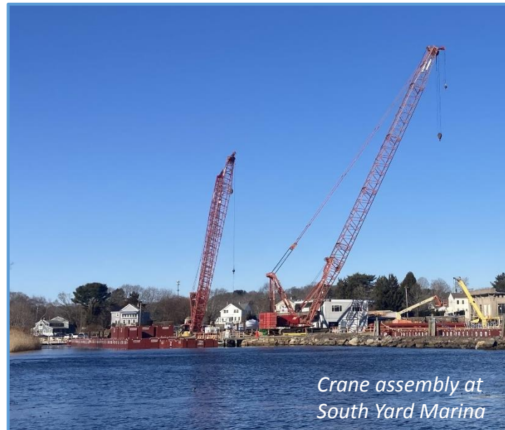
Crane assembly at South Yard Marina