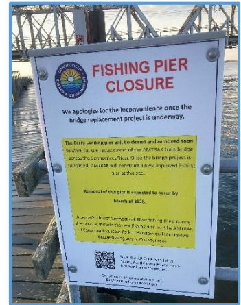
Above: Signage at Ferry Landing announcing closure.

Beginning from April 1, the Ferry Landing Pier will close and the new Eagle Landing Pier will open to accommodate anglers and nature lovers during construction. Once the bridge project is complete, Amtrak will construct a new and improved fishing pier at the Ferry Landing State Park site. The work at both piers is occurring as a result of coordination between Amtrak and the Connecticut Department of Energy and Environmental Protection (CTDEEP). Please visit the CTDEEP website with the current information on the closure.