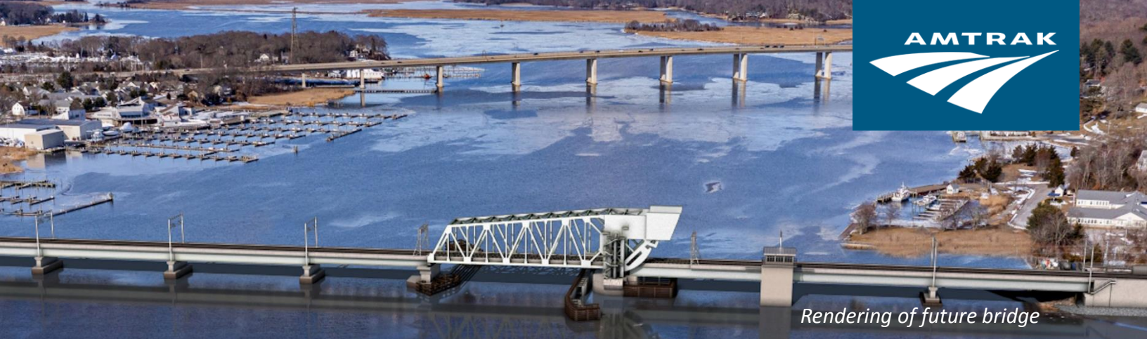
Rendering of future bridge