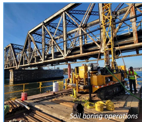
Soil boring operations