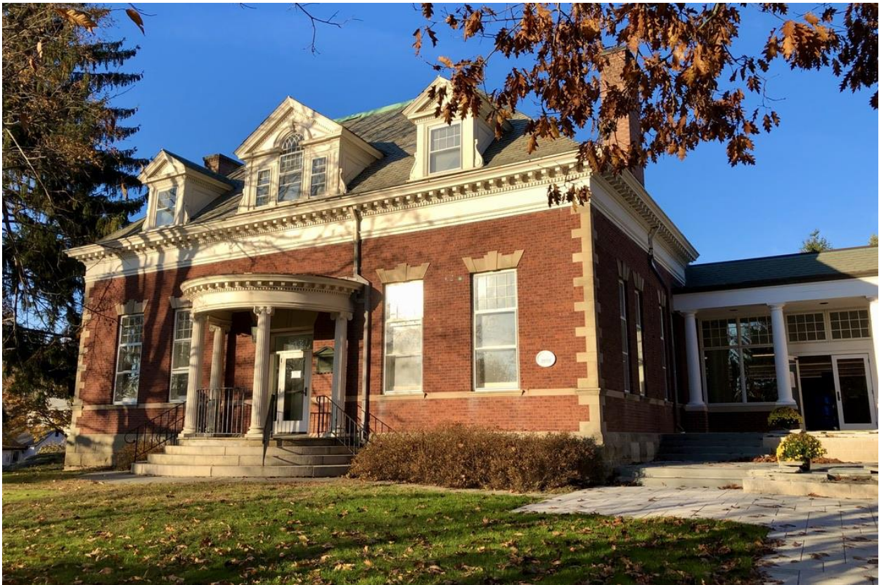
Phoebe Griffin Noyes Library