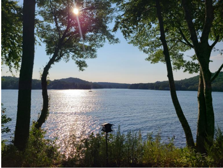
Rogers Lake