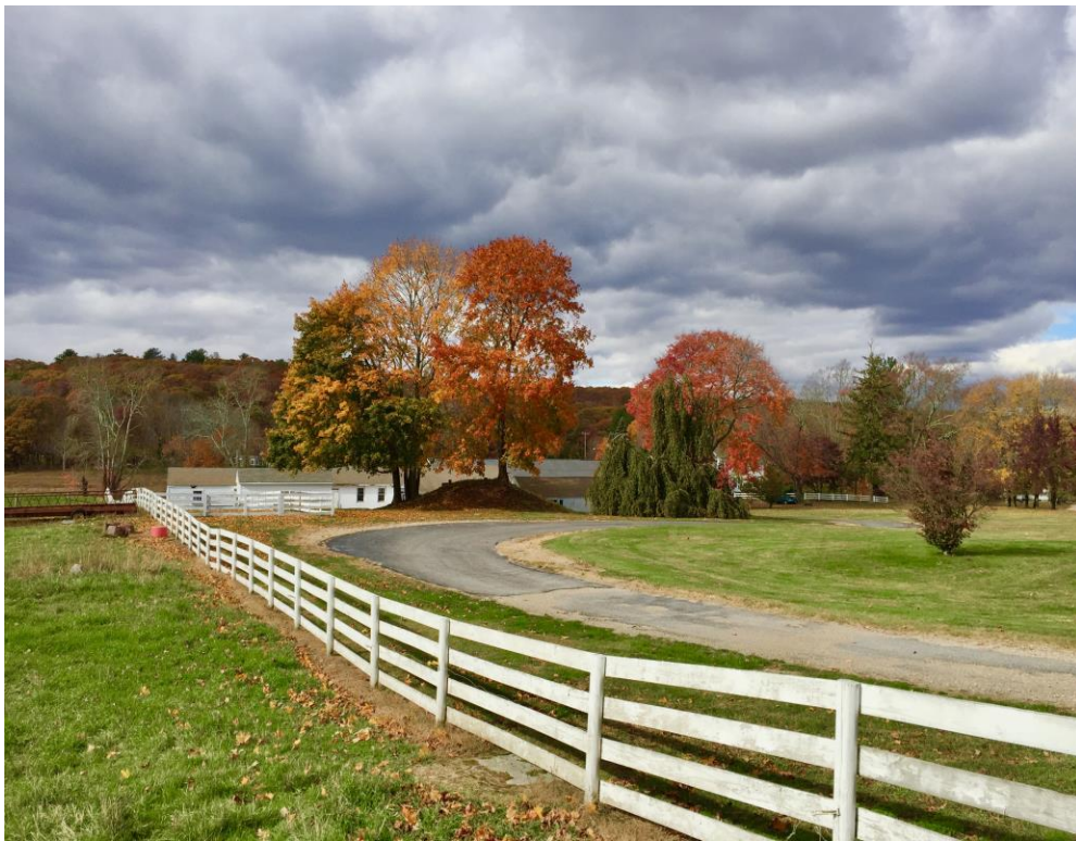
Marsh Farm

Conservation Commission Economic Development Commission Harbor Management Commission Old Lyme Affordable Housing Corporation Old Lyme Sustainable CT. Committee Open Space Commission Water Pollution Control Authority Zoning Commission