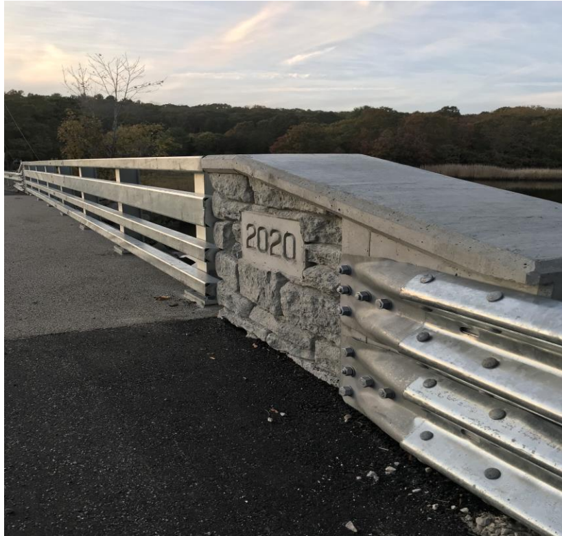
Mile Creek Bridge