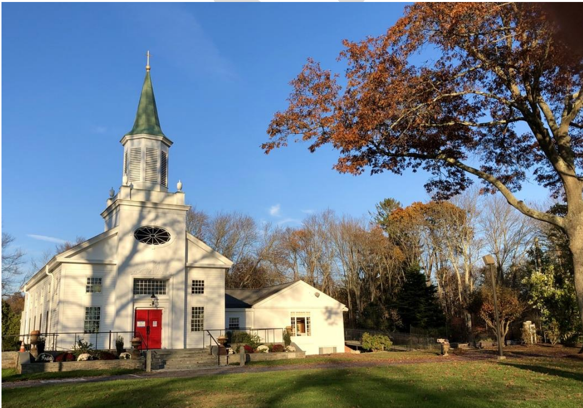
St. Ann's Episcopal Parish