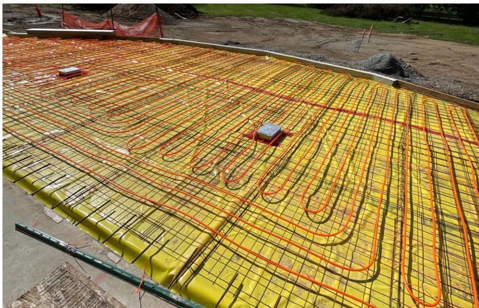
Radiant heat piping at South addition