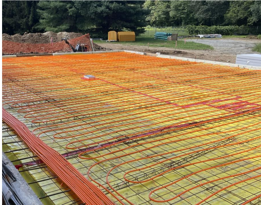
Radiant heat piping at West addition