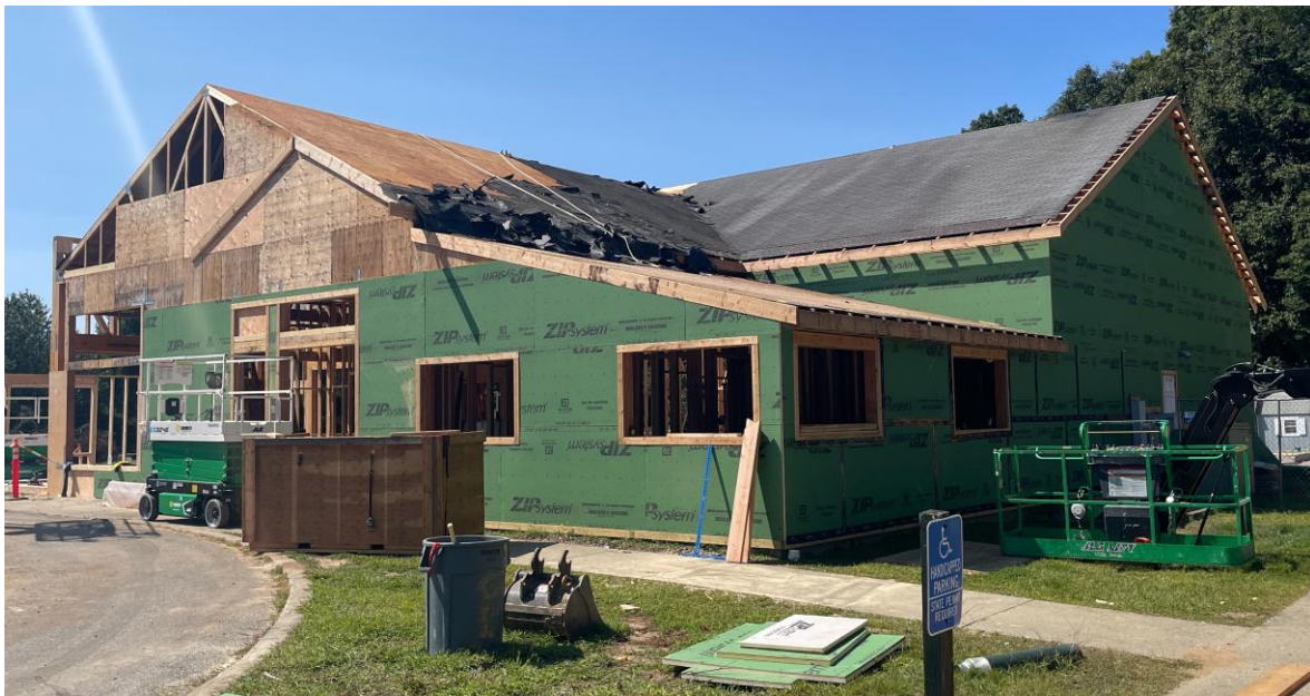
Sheathing on the Northeast elevation