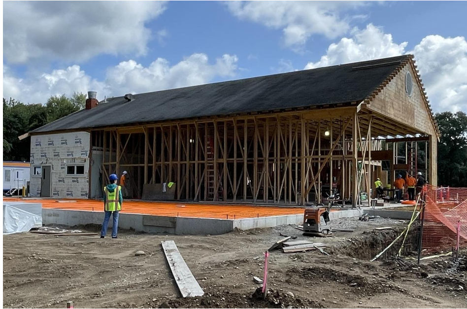
Southwest elevation before slab pour