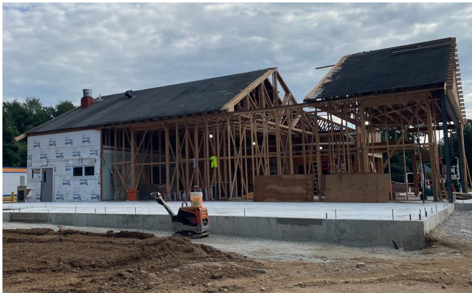
Southwest elevation after slab pour and selective roof demo for the cupola