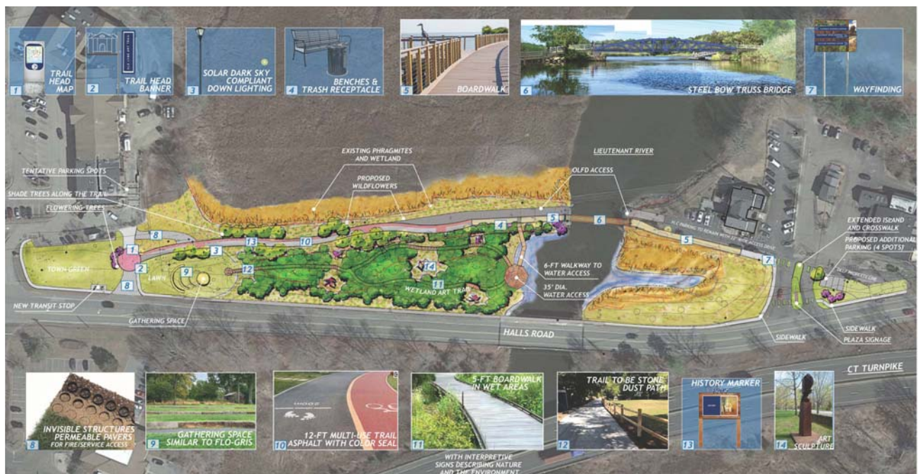
Scope of project with Art Theme and one set of details.

In terms of final net costs to Old Lyme, the sidewalks are the most expensive part of the Master Plan. The Bridge and trails are less expensive. The proposed new zoning (HROD) will actually make money for the town. All three work together to keep Halls Road a flourishing part of Old Lyme into the mid-21st century.