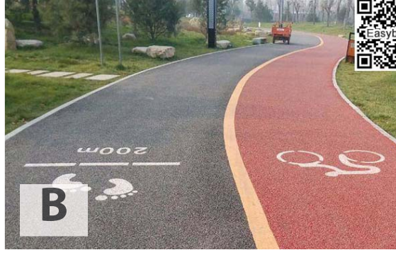
Asphalt with Color Seal

51 - More Natural. Visually pleasing, Florence Griswold Museum (FGM) similarity. Should be a pervious material.