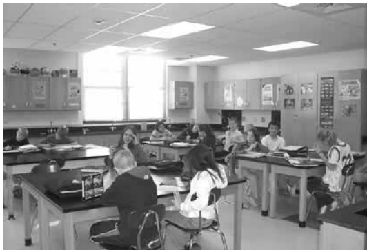
Science classroom, Middle School