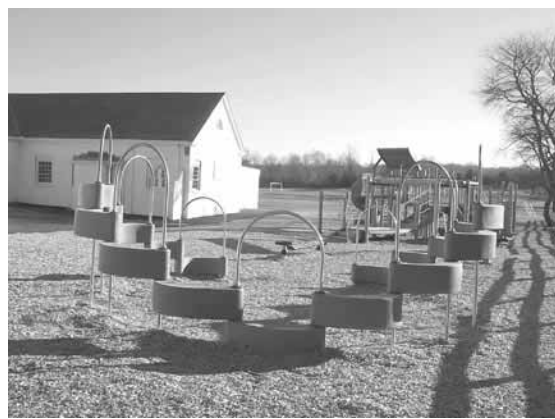
The new Center School playground's multifunction playscapes have been replaced by a greater number of apparatuses, each with specific functions and handicapped accessible. The ground is also covered with a more resilient mulch.