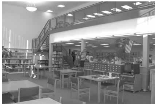
View from inside the Middle School library