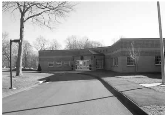
New entrance to Mile Creek School