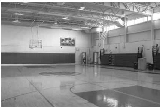
Lyme-Old Lyme Middle School gymnasium

As Old Lyme becomes increasingly developed, OLCT is seeking to expand protected open space in town, working on its own and in partnership with others. Information on the types of conservation options available to landowners is readily available from the trust (for example, easement, donation, bargain sale, etc.), and we welcome the opportunity to talk with anyone further about these. OLCT also welcomes anyone interested to join our committees and become actively involved with the trust. We work on a volunteer basis and are open to all. Please do contact us for more information and be sure to visit your OLCT preserves!