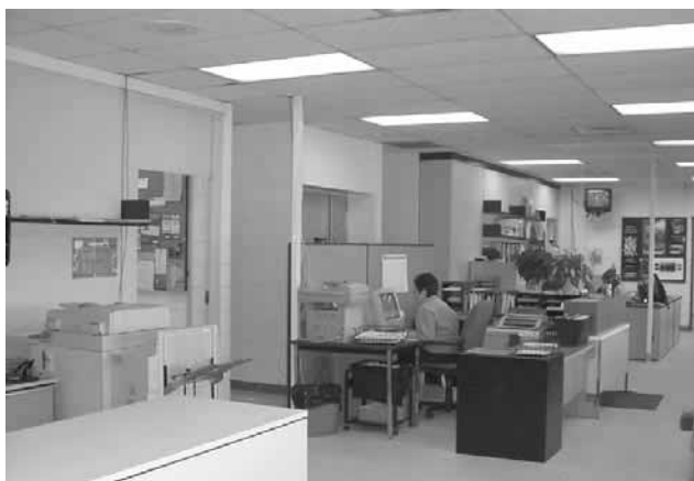
The newly reconfigured high-school guidance office