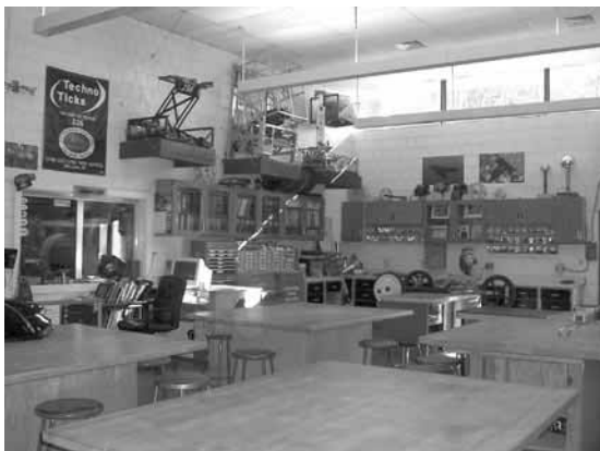
The High School shop, home of the "Techno Ticks," with robots visible on the high shelves