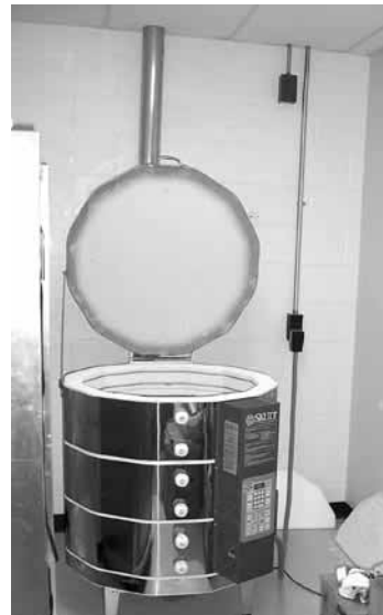
The Middle School kiln, in a small separate room off the art room, gets a lot of use.