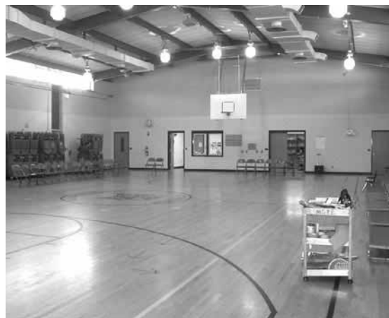
Mile Creek School gymnasium—no more stage, but the teacher now has an office with a window!