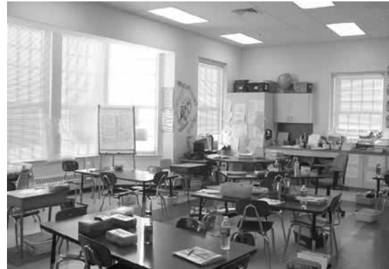
This Center School classroom was originally the kindergarten; the classic wooden lockers with animal cutouts have been removed.