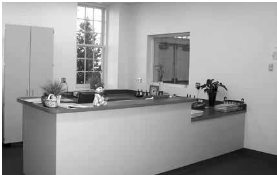
The office at Center School now offers a view of the front door for better security.