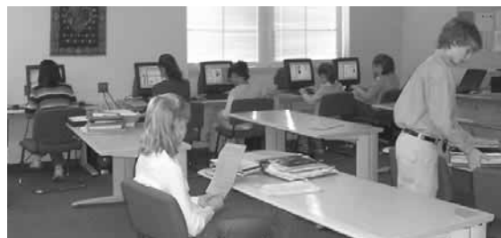
Computer lab, Middle School