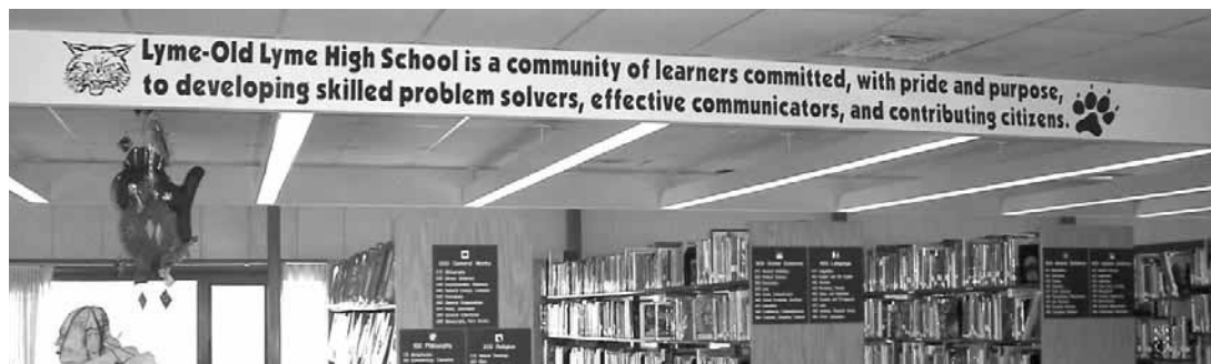
The high school library, where the mission statement is displayed.