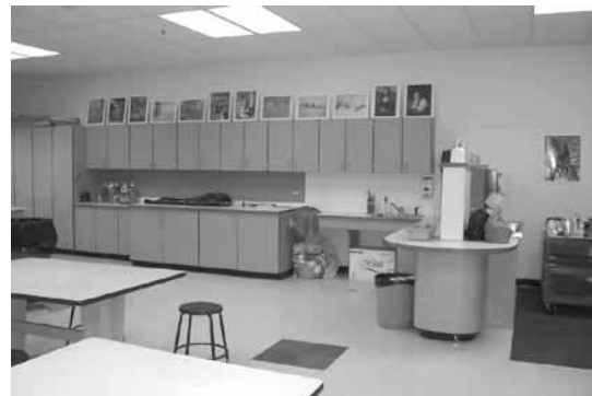
The new middle school art room, formerly shop space, is spacious and has great light.