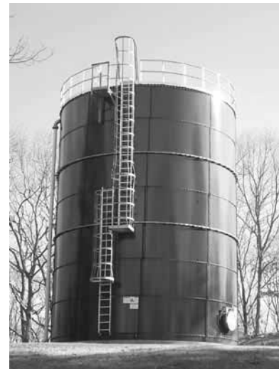
Water tank for Lyme Street campus

Although not renovated, the high school received the campus-wide benefit of a new water system and septic treatment plant, along with air conditioning.