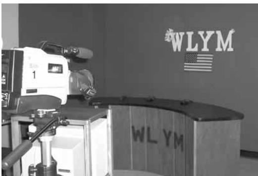
The Lyme-Old Lyme High School television station, WLYM, which broadcasts four minutes of announcements, school news, and sports to all classrooms each morning.

As Adelphia has reorganized financially and organizationally more and more decisions are being made at the corporate level rather than by local management. Similarly, local customer service personnel were reduced substantially in order to implement a national twenty-four-hour customer service center. While this is a trend among cable and other industries only time will tell if it improves the efficiency and effectiveness of customer service. Individual subscribers with questions or concerns should feel free to contact Adelphia management (889-6269) or the Cable Advisory Council.