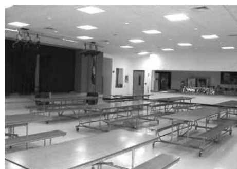
The Mile Creek School cafeteria now has a stage (left), with the serving area in the rear.