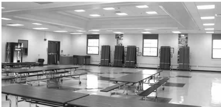
Remodeled Middle School cafeteria