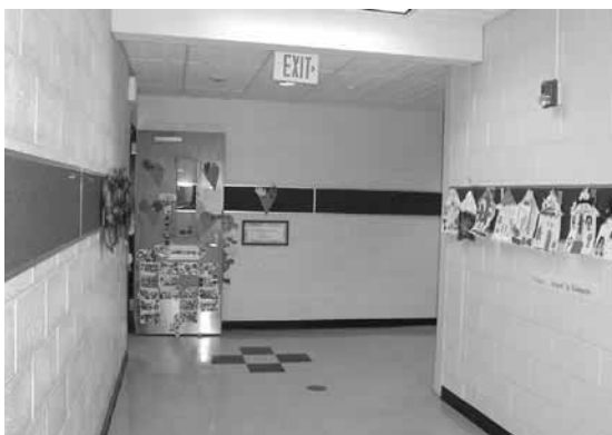
One Mile Creek School hall that USED to end in a double classroom now is a hallway to the front wing, enclosing a courtyard and offering more accessible emergency exits.