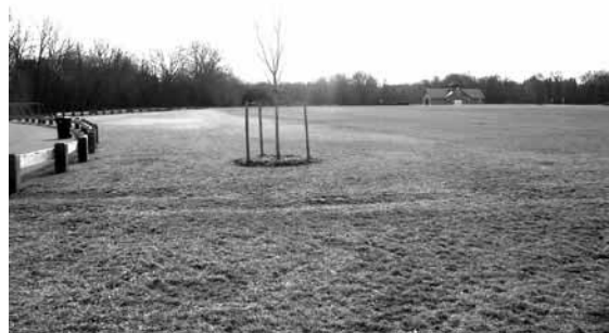
View across two playing fields toward park building

The view from the senior center that USED to be corn fields . . . now looks like THIS instead!