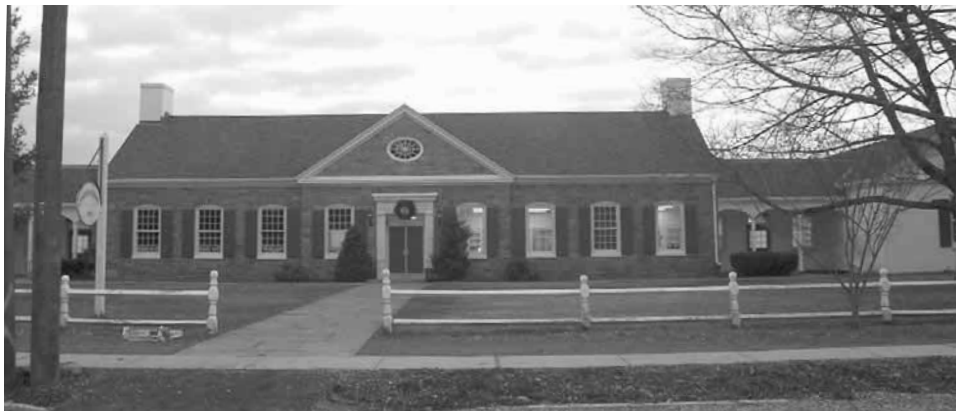
Center School looks the same, but inside . . . “renovated as new”!