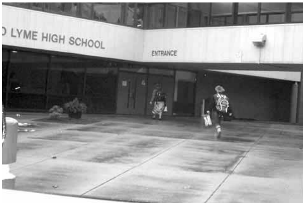
Lyme-Old Lyme High School entrance

The court has a variety of informational brochures available. As always, you are welcome to visit the court for information relating to the functions and procedures of the Probate Court. Hours are Monday through Friday, 9:00 a.m. to 12 noon and 1:00 to 4:00 p.m.