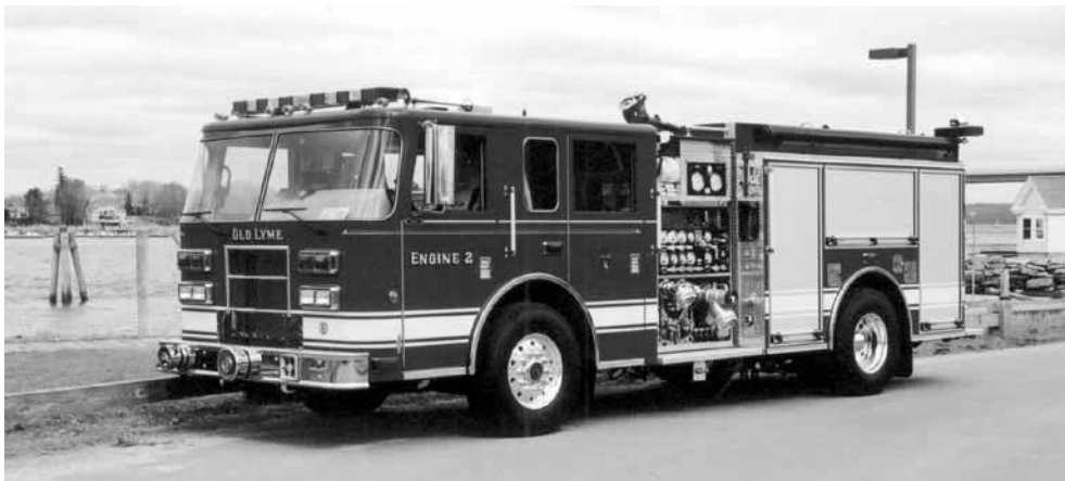
Old Lyme Fire Department's new 2004 Pierce Saber attack engine