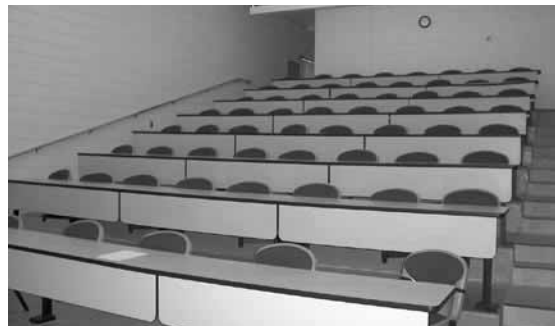
The new seminar room in the high school has great acoustics for the chorus as well as for anyone holding a meeting here.