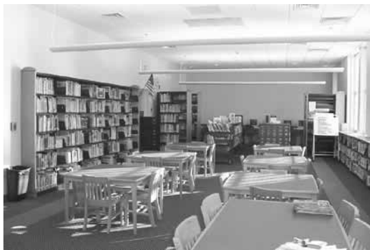
New Center School media center, with circulation desk, office space, work room, seating area, book storage, and a mini computer lab.